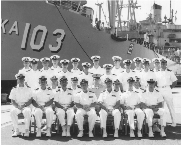
Officers of the USS Rankin – 1963